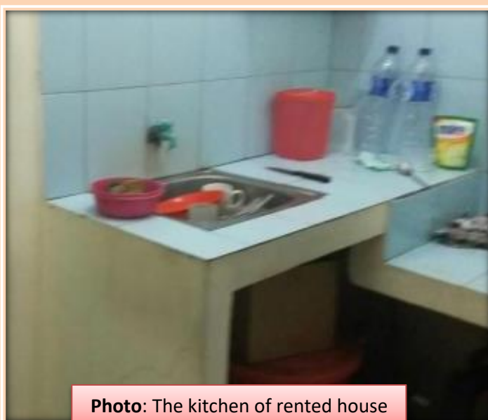
Photo: The kitchen of rented house